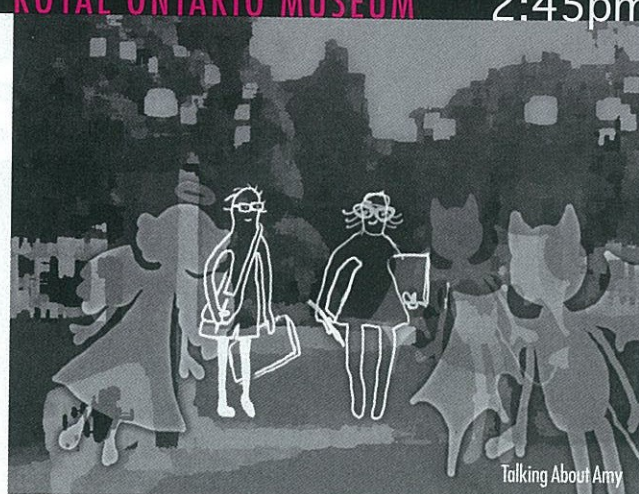
Talking About Amy